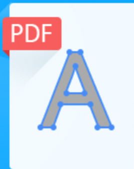
Vector PDF support